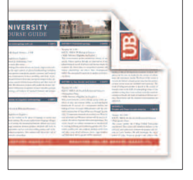
Dramatically reduce paper usage with standard automatic two-sided (duplex) output.