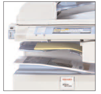
Create professionally finished documents completely in-house with the 500-Sheet Internal Finisher and optional 2 & 3-hole punching.

The Internal Shift-Sort Tray (optional) separates finished sets for easy pickup and delivery.