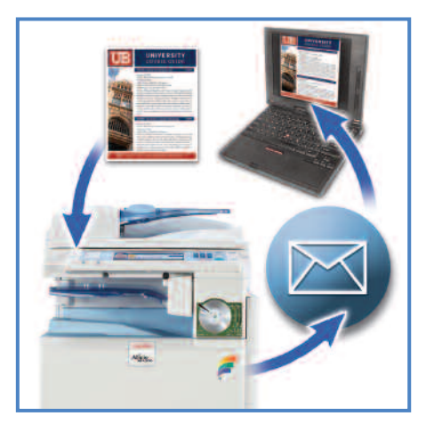
Minimize network congestion and transmit files more efficiently with Scan-to-URL. This feature stores documents on the Hard Disk Drive and allows recipients to view and download them from any Web browser.

Set output limits and control costs on an individual or group level with the Quota Setting feature.