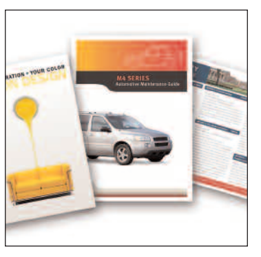
Store up to 2,000 documents with a standard Document Server —a highly secure, virtual filing cabinet. Frequently used documents can be re-printed, re-faxed and re-distributed quickly and easily.

Minimize paper replenishment time with two standard front-loading Paper Trays that hold 250 sheets each. A standard Bypass Tray holds an additional 100 sheets. All three trays accept a variety of paper types and weights.