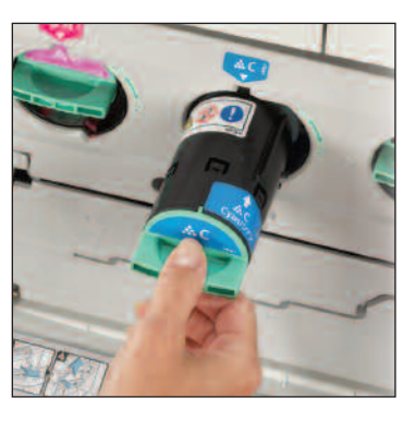
Ricoh's energy-saving PxP" toner produces brilliant color output for your business documents.

A helpful and highly intuitive 8.5 " full-color LCD Control Panel with animated graphics simplifies a wide range of jobs.