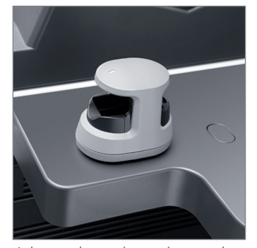
Advanced security options and multiple authentication systems