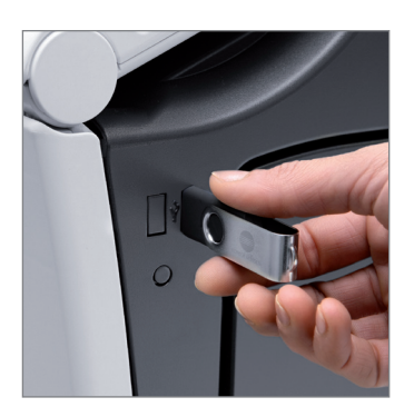
Direct printing and scanning via USB for direct management of Microsoft Office formats

The high resolution screen also lets you read documents saved to the 250GB hard disk and to see a preview of the document that is being processed.