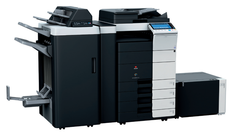
d-Color MF452 - MF552