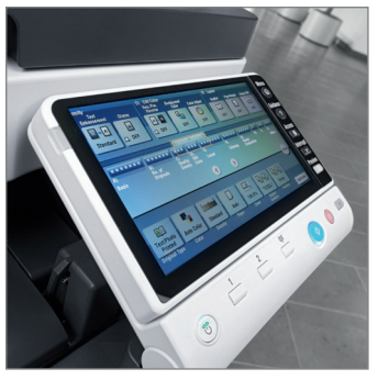
Capacitive 9.5" control panel

The new "d-Color" family comes with the best tools for managing medium-large groups of work (with the d-Color MF222-282-362models) and for small production centres (with d-Color MF452-552) while always providing highly professional colour management.