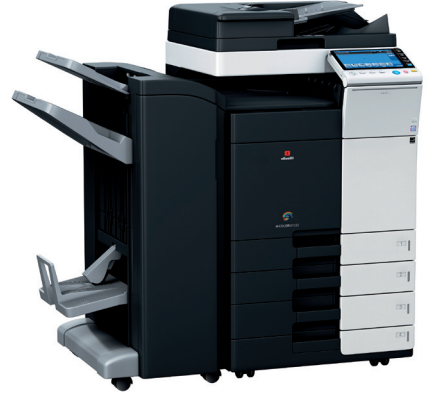
d-Color MF222- MF282 - MF362