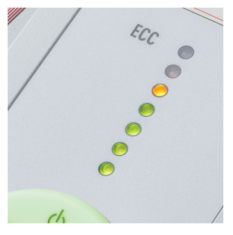
ECC - ELECTRONIC CAPACITY CONTROL This electronic feature indicates the used sheet capacity during shredding process to avoid paper jams.

Ease of operation: intelligent multifunction switch element with integrated optical signals indicating the operational status. Additional "emergency switch" function.