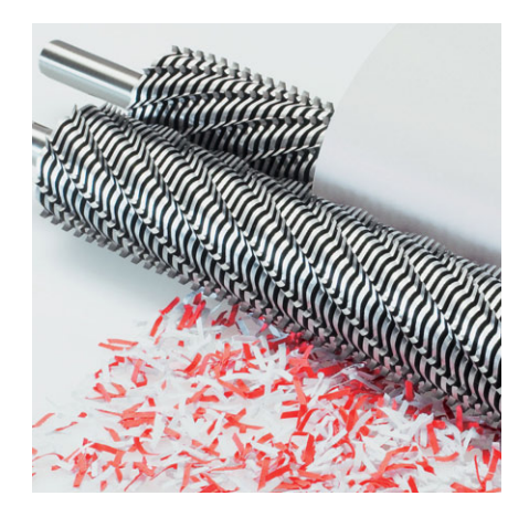
SOLID STEEL CUTTING SHAFTS

Robust and durable: high-quality paper clip proof cutting shafts with lifetime guarantee under conditions of fair wear and tear.