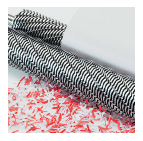
SOLID STEEL CUTTING SHAFTS

Robust and durable: high-quality paper clip proof cutting shafts with lifetime guarantee under conditions of fair wear and tear.