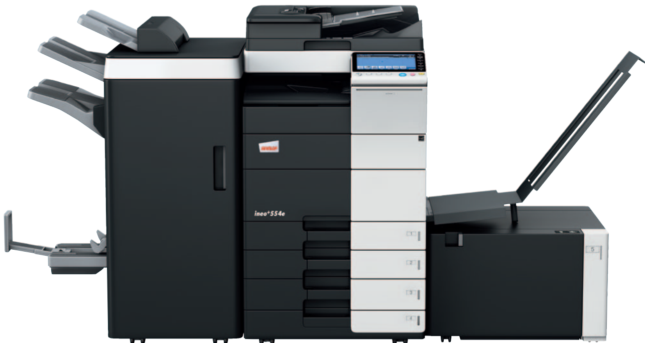
ineo+ 554e with staple finisher (FS-535), saddle kit (SD-512), job separator (JS-602), paper cassette (PC-210), large capacity unit (LU-204) and banner tray (BT-C1e)