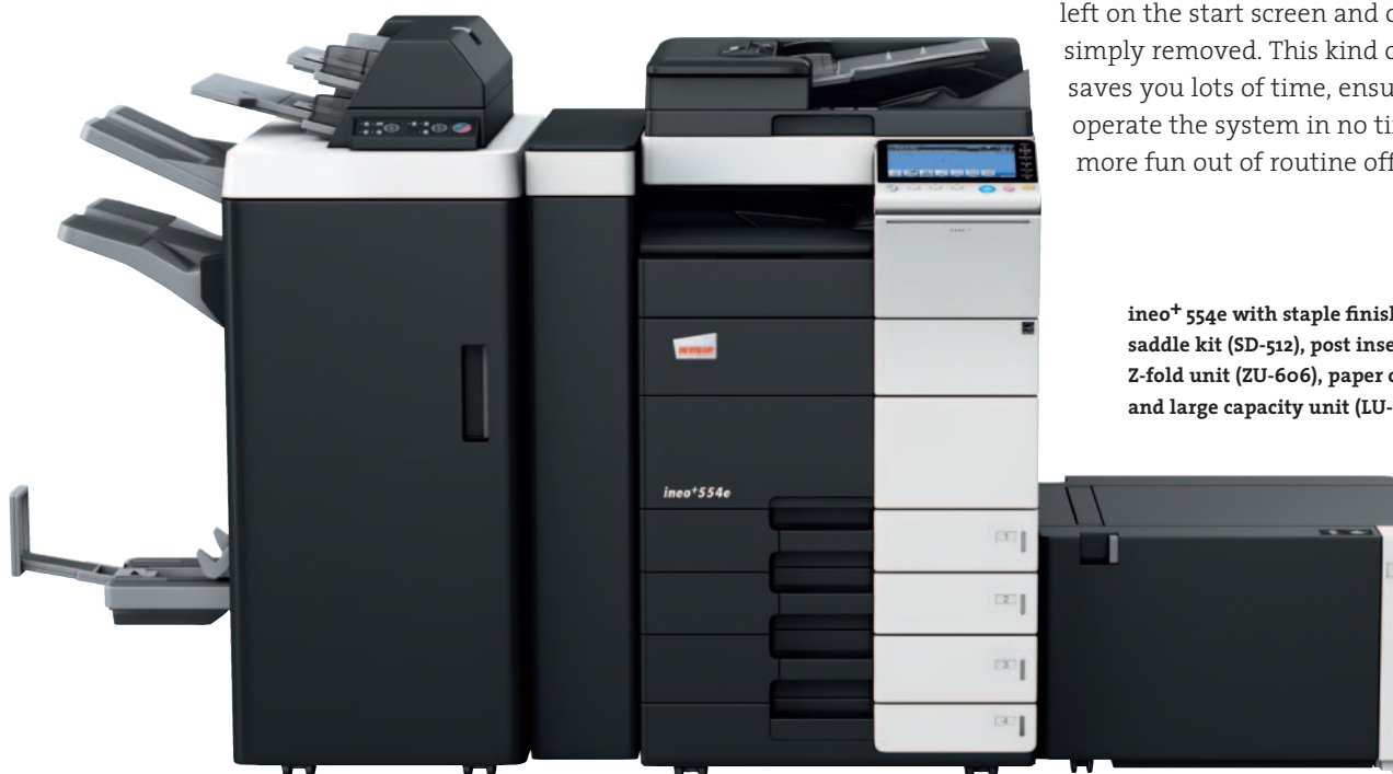
ineo+ 554e with staple finisher (FS-535), saddle kit (SD-512), post inserter (PI-505), Z-fold unit (ZU-606), paper cassettes (PC-210) and large capacity unit (LU-204)

left on the start screen and ones you don't use simply removed. This kind of customisation saves you lots of time, ensures you learn to operate the system in no time at all, and get more fun out of routine office jobs.