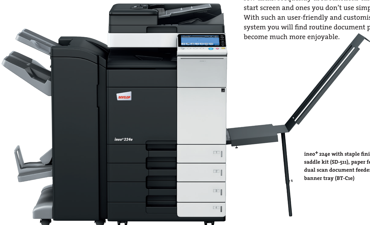
ineo+ 224e with staple finisher (FS-534), saddle kit (SD-511), paper feeder (PC-210), dual scan document feeder (DF-701), banner tray (BT-C1e)

Many multifunctional office systems are anything but user-friendly. The ineo+ 224e, in contrast, is simplicity itself. An intuitive, easily understandable operating concept ensures that it is as easy to use as your smartphone or tablet. The 9-inch capacitive touchscreen comes with familiar multi-touch operations such as flick, drag&drop and pinch in&out – so you will feel at home in this system in no time at all. Thanks to a new menu navigation structure you can see all functions in one go and select the settings you want with just a few clicks. Frequently used functions can be left on the start screen and ones you don't use simply removed. With such an user-friendly and customisable office system you will find routine document production jobs become much more enjoyable.