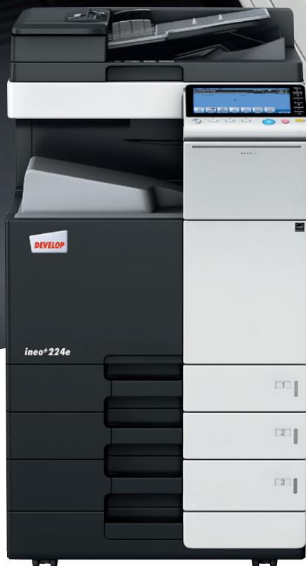
ineo+ 224e with paper feeder (PC-210) and dual scan document feeder (DF-701)