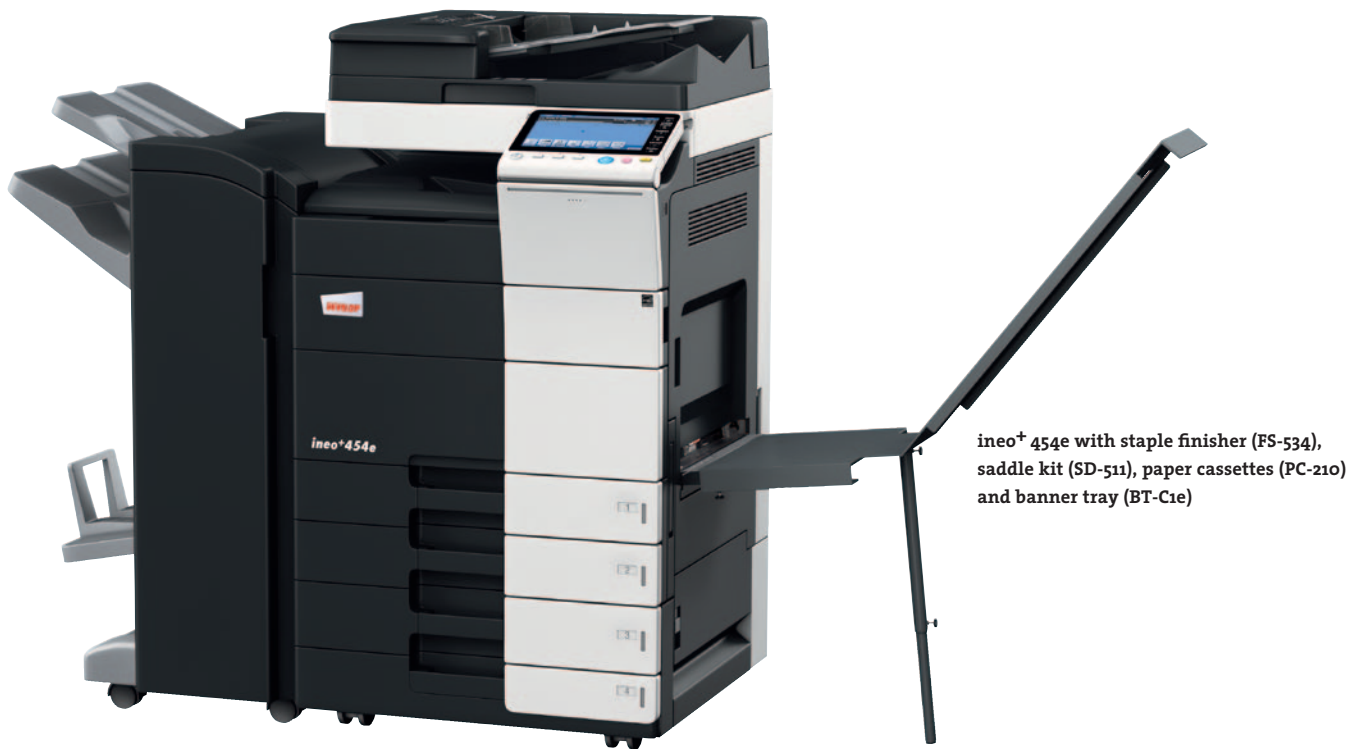
ineo+ 454e with staple finisher (FS-534), saddle kit (SD-511), paper cassettes (PC-210) and banner tray (BT-C1e)